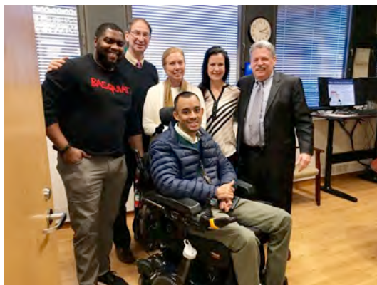
(United Spinal Association Staff with Bronx VA Researchers)